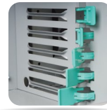
Tool-less card retainers