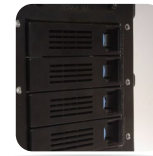
Removable HDD cage