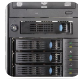
3 x 5.25" bays for ODD or storage kits