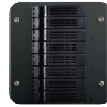
8 x 2.5" HDD cage with mini-SAS backplane