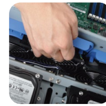
3 x hot-swap middle fan