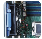
1 x rear 120mm PWM fan