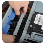
Easy maintenance HDD backplane kit