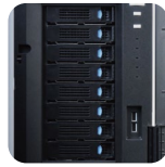
4 or 8 x 3.5" hot-swap or non Hot-swap HDD bays