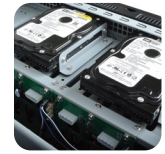
2 x 3.5" internal HDD bays