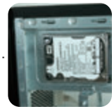
2 x internal 2.5" HDD bays